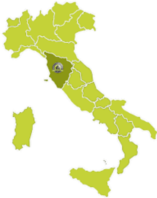
Tuscany within Italy