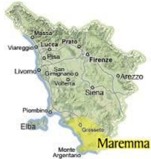
Maremma within Tuscany